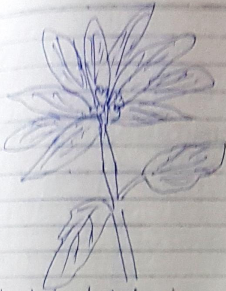
Euphorbia pulcherrima A flowering branch