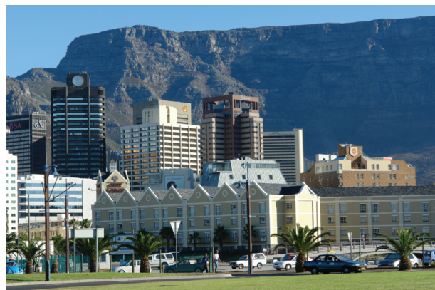
Figure 1 Cape Town, South Africa with more than 3 million residents is located in the Cape Floristic Region, an area with the highest density of plant species in the world with more than 9600 plants species of which 70% are endemic. Through initiatives like Working for Wetlands and Cape Flats Nature, successful efforts are taken to address the large challenge of conserving precious biodiversity in fragmented natural habitats in an urban setting where poverty is widespread. These initiatives focus on building bridges between people and nature and demonstrating benefits from conservation for the surrounding communities, particularly areas where incomes are low and living conditions are poor; and encouraging local leadership for conservation action.

Urbanization is today viewed to endanger more species and to be more geographically ubiquitous than any other human activity (Figure 1). For example, urban sprawl is rapidly transforming critical habitats of global biodiversity value, for example, in the Atlantic Forest Region of Brazil, the Cape of South Africa, and coastal Central America. Urbanization is also viewed as a driving force for increased homogenization of fauna and flora. In the urban core in Northern Hemisphere cities, a similar set of species is recorded that is, often cosmopolitan plant and animal species tolerant of anthropogenic impacts. For example, the composition of communities of wildlife species found in cities across the US is remarkably similar despite large variation in climate and geographical features. A common pattern among cities is that they often show a high turnover of species with losses of native species and gains of non-natives over time. For example, it is documented that New York has lost 578 native plant species while it gained 411, and Adelaide lost 89 while it gained 613 new plant species over a period of 166 years. Although cities may be species rich, frequently having higher species diversity than surrounding natural habitats, this is often due to a high influx of non-native species and formation of new communities of plants and animals. A trend of increasing non-native species from the suburbs to